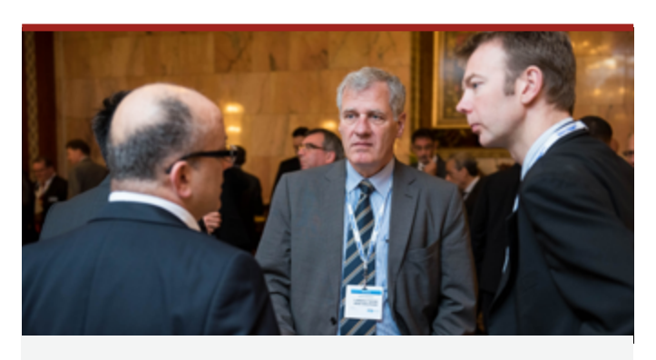
Refreshment Breaks: $7,500* Host the networking breaks during the conference, which offers multiple opportunities to enhance a sponsors' brand